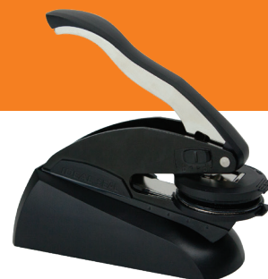
Round Embosser with Base

Embossers recommended for 20# paper only