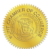
Impression Area: 2"