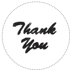
FC3 | 2" Round"

Culver Family Dentistry 191 Combs Street Scottsdale, AZ 85260 X-RAYS enclosed