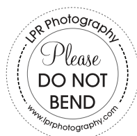
4642 | 1-3/4" Circle